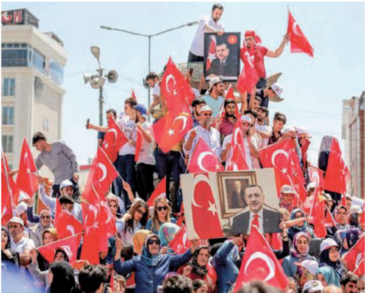
Figur 2: Turkish people on the streets after the July 15th attempted coup

The Erdoğan administration reacted quickly, by using all media to build the narrative of a terrorist organization which kills “unarmed innocent people” 60 and “ploughs over citizens” with tanks (Ibid.), while portraying the government of Turkey as the guardian of democracy and liberal rights. It has even been decided that July 15 will be remembered as “Democracy Day” (Ibid. p. 5). The 90-page colour booklet published by the government-controlled Anadolu Agency is a great example of government propaganda. 61 Below is the first picture in the booklet of the triumphant Turkish people – holding a picture of Erdoğan with Atatürk in the background.